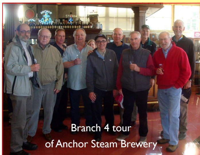
Branch 4 tour of Anchor Steam Brewery

★ Buy your raffle tickets early for a chance to win. ★ Proceeds will be for the benefit of our Branch.