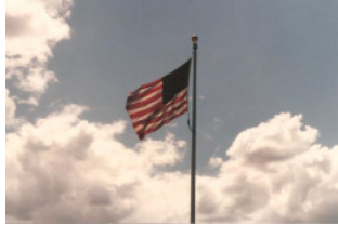
God Bless America