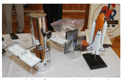
Models of Space Shuttle and Hubble Telescope