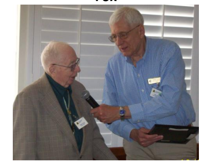
Walk for Health