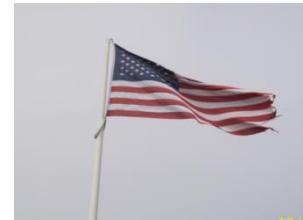
God Bless America