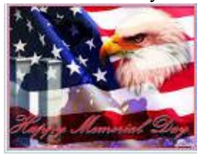
Fly your Flag!

time to remember and appreciate mothers and mother figures (grandmothers, grandmothers, stepmothers, and foster mothers). Many people make a special effort to visit or call and give or send cards. Common Mother's Day gifts include flowers, chocolates, candy, clothing, jewelry, or treats, such as a beauty treatment or a trip to a spa.