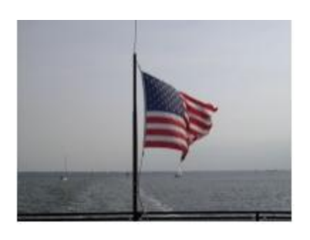
God Bless America

Memorial Day was originally named Decoration Day. It was initiated on May 30, 1866, a year after the war ended, to honor both the Union and Confederate soldiers who died during the American Civil War. The public holiday was meant to unify the celebration as a national day of remembrance for both the Union and Confederate service men on the same day. The day later became known as Memorial Day and was expanded to include deceased veterans of all wars