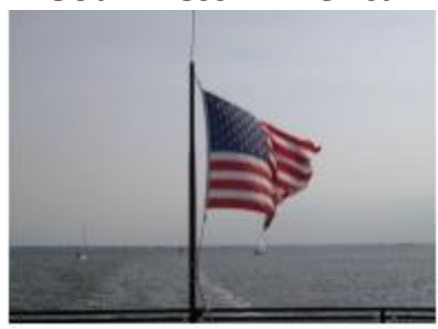
God Bless America

October 2016 Issue Meeting October 5th Next meeting November 2nd