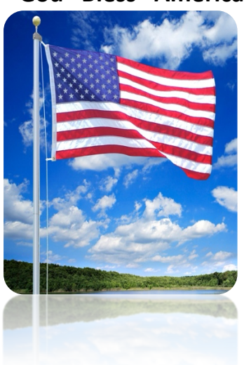
June 2022 Issue Basque Cultural Center 599 Railroad Ave. South San Francisco

<u>Lunch Basics.</u> Entrée choices for June's lunch: Chicken Cordon Bleu, Salmon, or Vegetarian Pasta. Salad and Coffee/Tea are included. Bar opens at 11:30AM, lunch is served at 12 Noon. Cost is $30.00, <u>exact change is appreciated and checks are accepted</u>. Please let us know if you are attending and your entrée choice. We need your information no later than June 5<sup>th</sup> so we can reserve your choice. Respond to <u>SIRpaul@nocero.com</u>, or by phone to 415-254-8175.